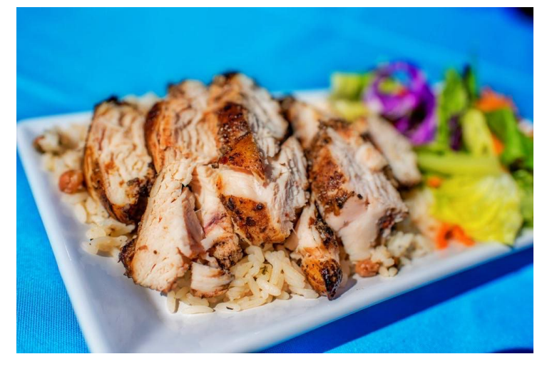
Renee's Jerk Chicken is located in the parking lot of In-Fretta Pizza and Wings in Plano at 5588 Texas Highway 121, Suite 300.

A former flight attendant's food trailer has landed in Plano.