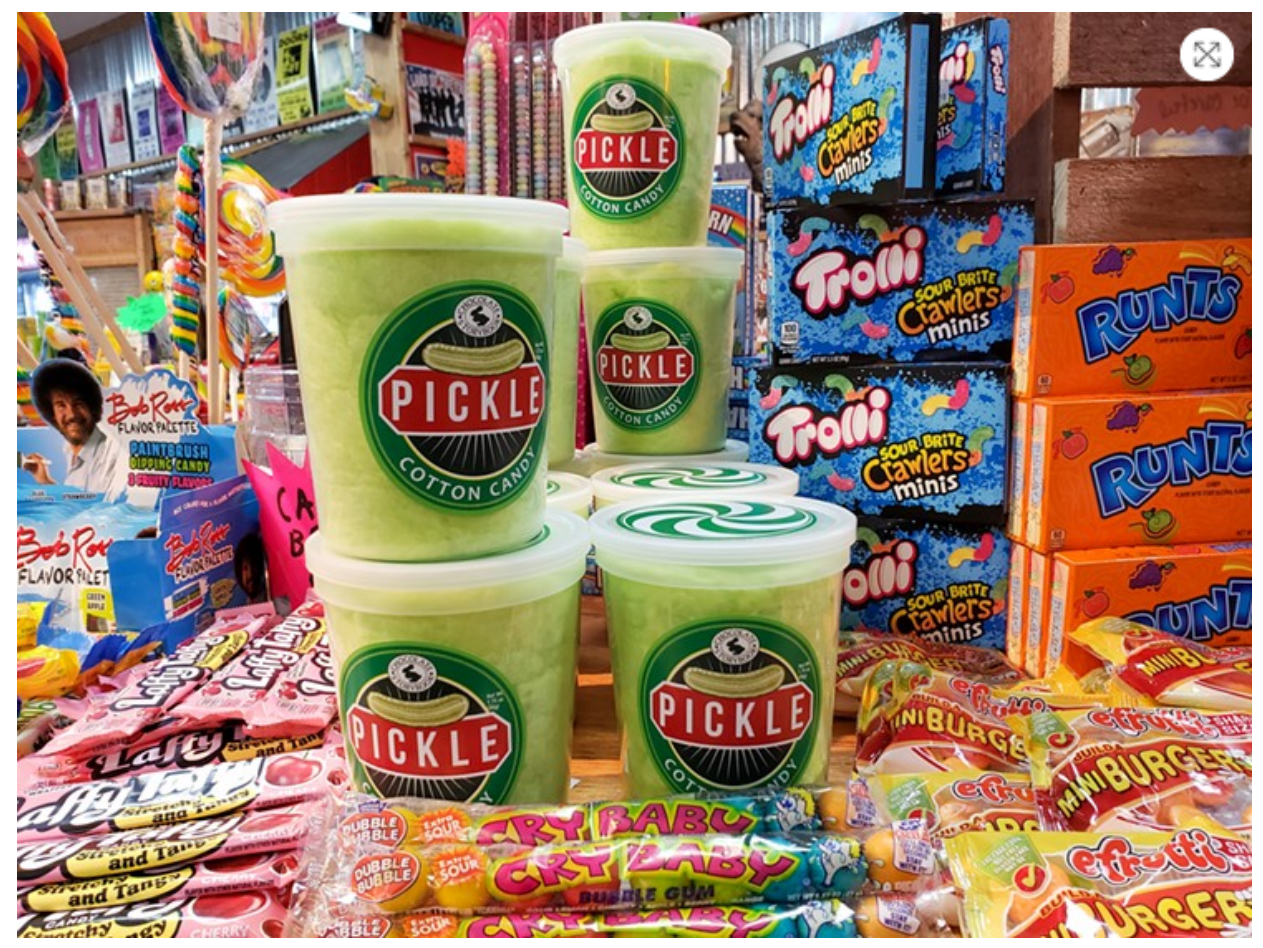
Pickle cotton candy? Oh, why the heck not?