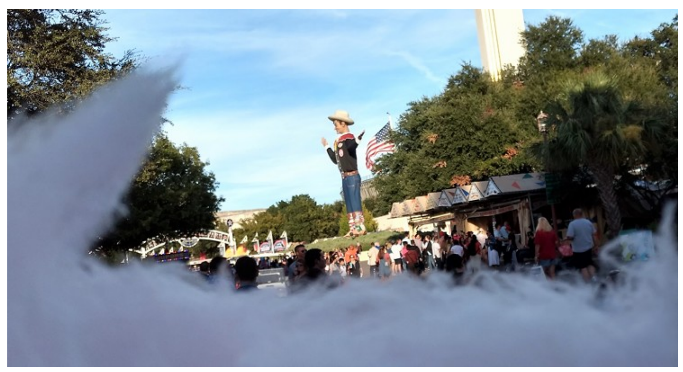
Big Tex, as seen over a half-eaten cone of cotton candy at the State Fair of Texas