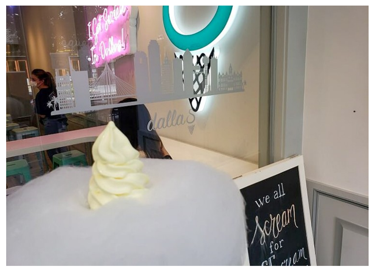
Pineapple soft-serve with cotton candy from Aqua S