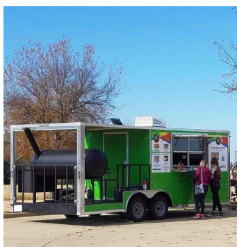
Renee's Jerk Chicken is located in the parking lot of In-Fretta Pizza and Wings in Plano at 5588 Texas Highway 121, Suite 300. (Juline Mathe)

Having grown up in Jamaica, and born into a family of chefs, it was already in her blood.